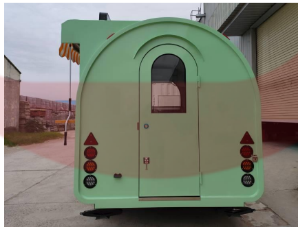
- Door -