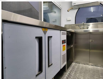
- Fridge -