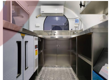
- Interior -