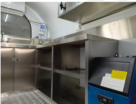
- Kitchen Equipment -