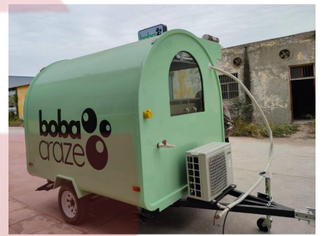
- Rear -