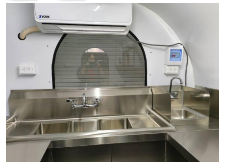
- Sinks -